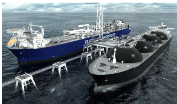
Figure 1. Flex LNG Producer, first floating LNG FEED.

Though Eni's Coral FLNG project, offshore Mozambique, may be an exception, it is unlikely FLNG will be used extensively to exploit stranded gas many miles from shore. This requires a turret and a complete gas processing facility atop an LNG storage vessel with all gas reception and