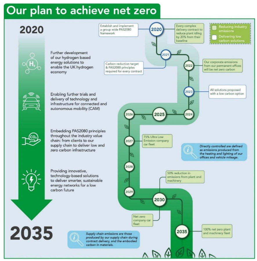
Figure 1. Costain Group PLC Climate Change Action Plan targets.

The breakdown of our Group footprint per scope can be seen in the figure 2 below. For the second year, we have included the embodied emissions of our most carbon-intensive materials: concrete, steel, aggregate, and asphalt within our Scope 3 emissions. In 2022 we increased the number of supplier-sourced data included within our purchased goods and services boundary, creating a 33% increase in emissions relating to goods and services. All other Scope 3 categories including business travel, waste, and energy and fuel-related activities saw a reduction in emissions against the baseline. As a result, overall, we saw a 13% increase in absolute emissions however we have improved data quality within our Scope 3 emissions.